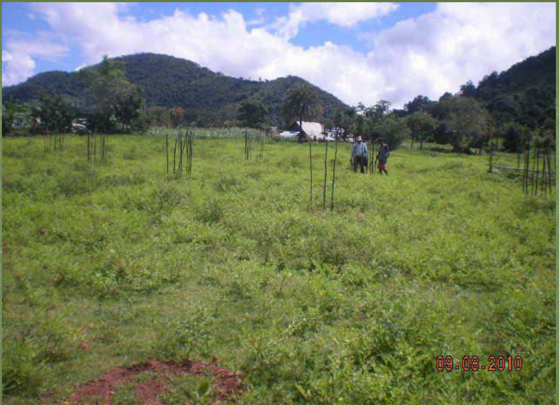
The Beneficiary trying to protect the plant in bamboo cuttings in Baliganda village