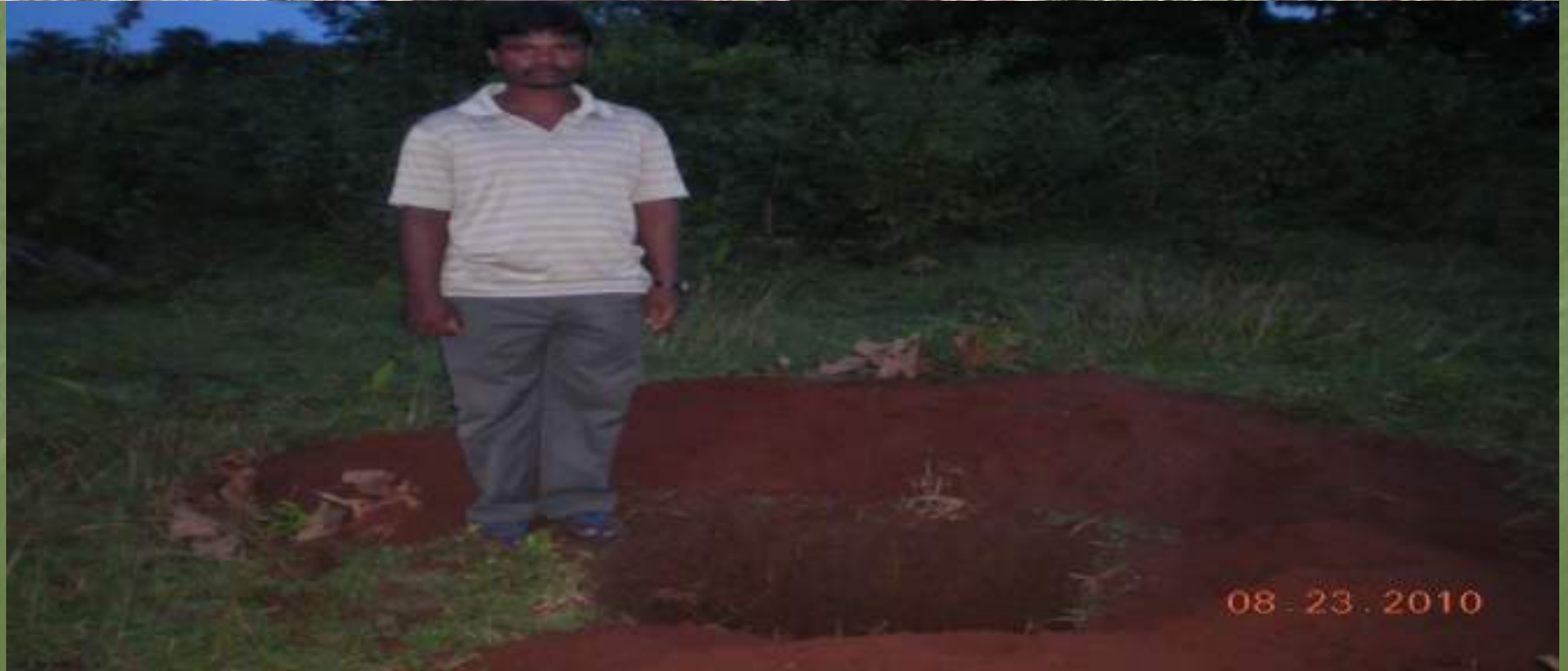
Fields are ready for plantation at Danjurba