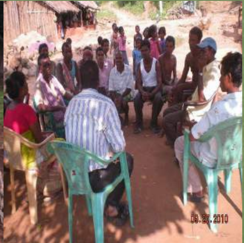
Village meeting at Putasing