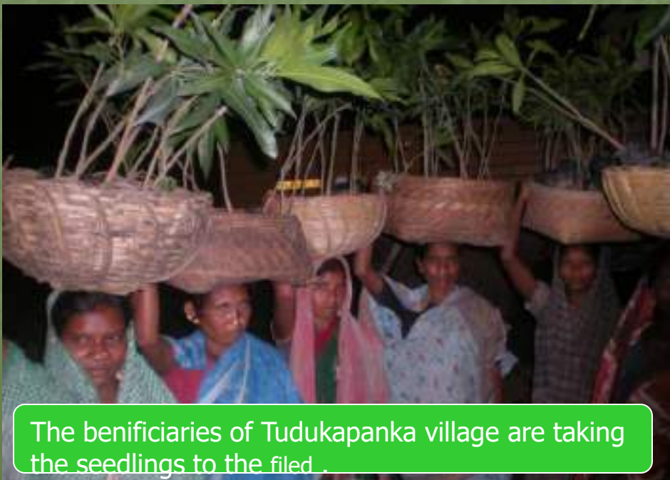
The beneficiaries of Tudukapanka village are taking the seedlings to the field .