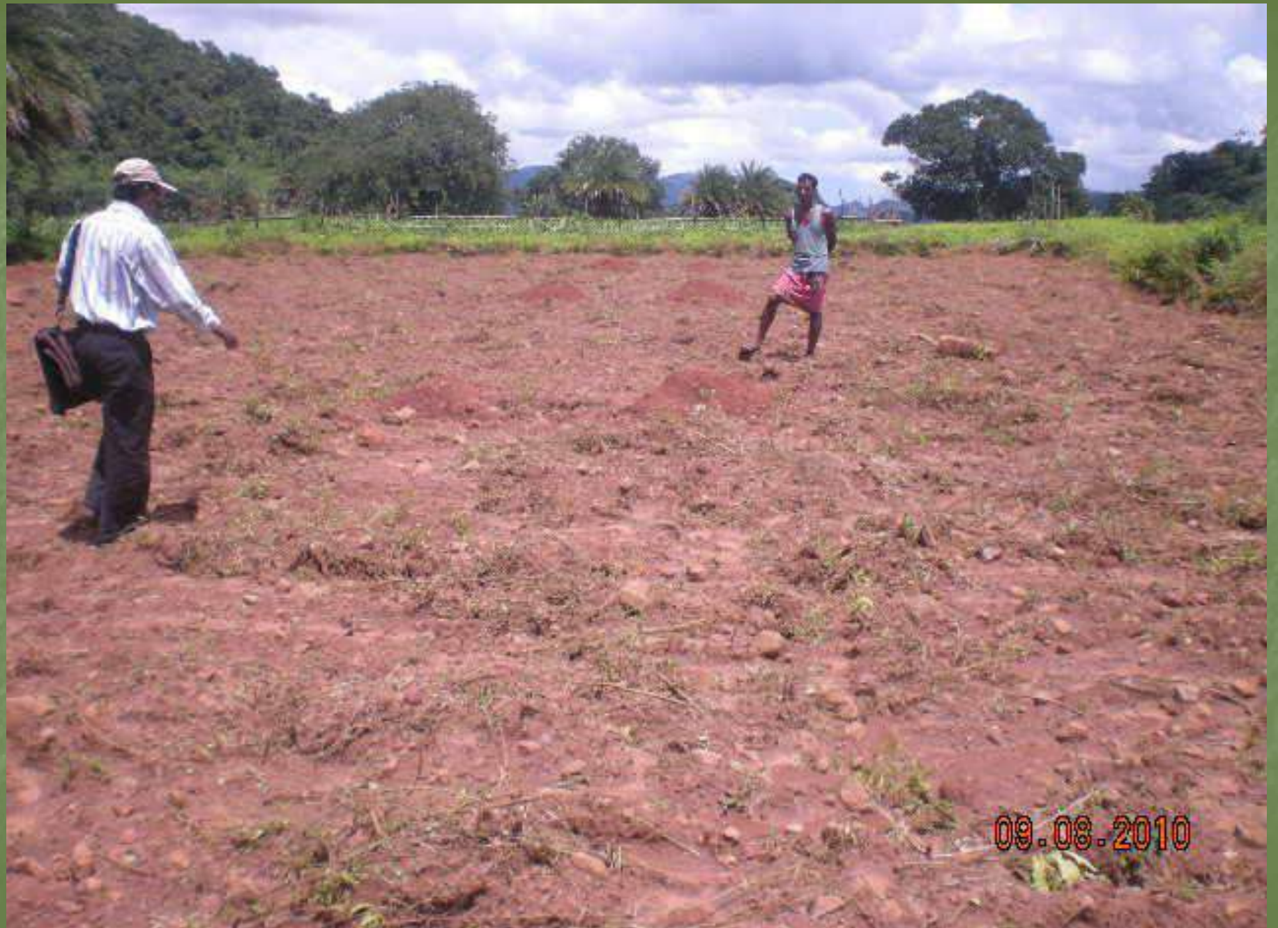
Fields are prepared for cashew & Mango plantation at Baliganda village