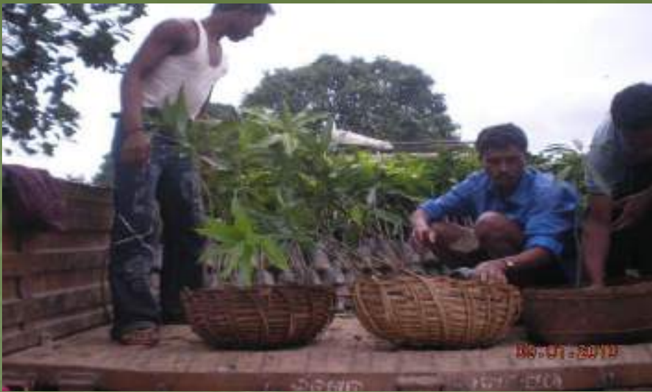
Mango plants are unloaded from the truck at Danjurba Village