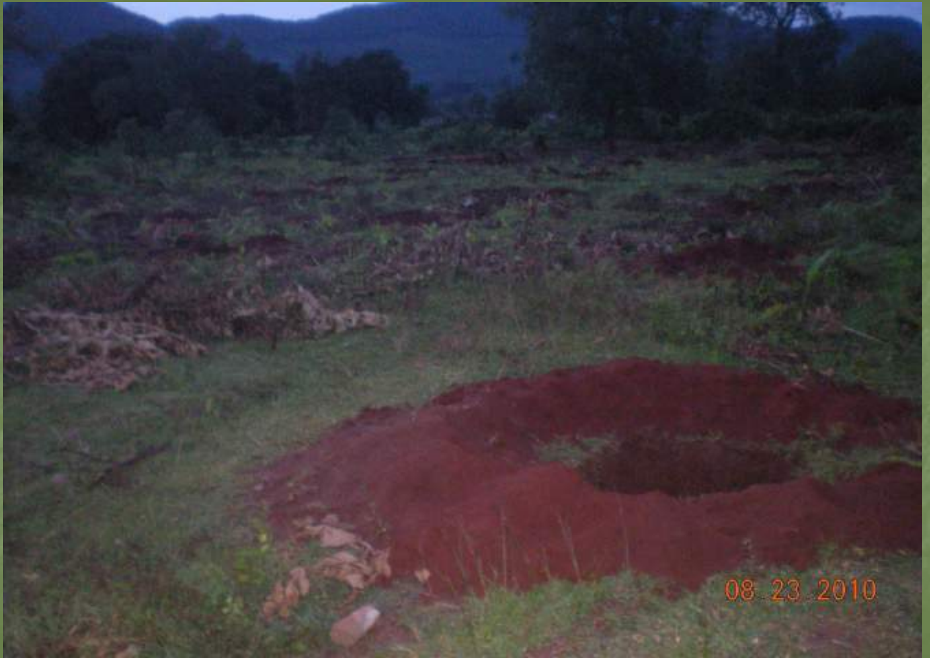
Fields are ready for plantation in Danjurba village