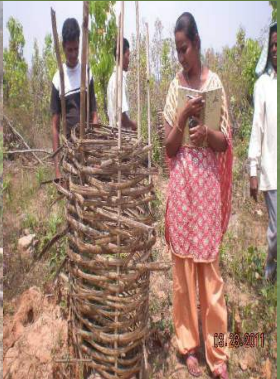
Plants are protected with Bamboo at Baliganda Village